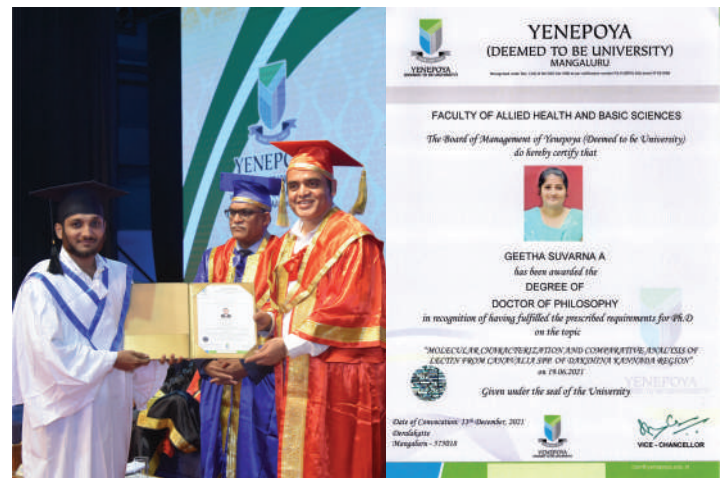
Convocation & Degree Certificate